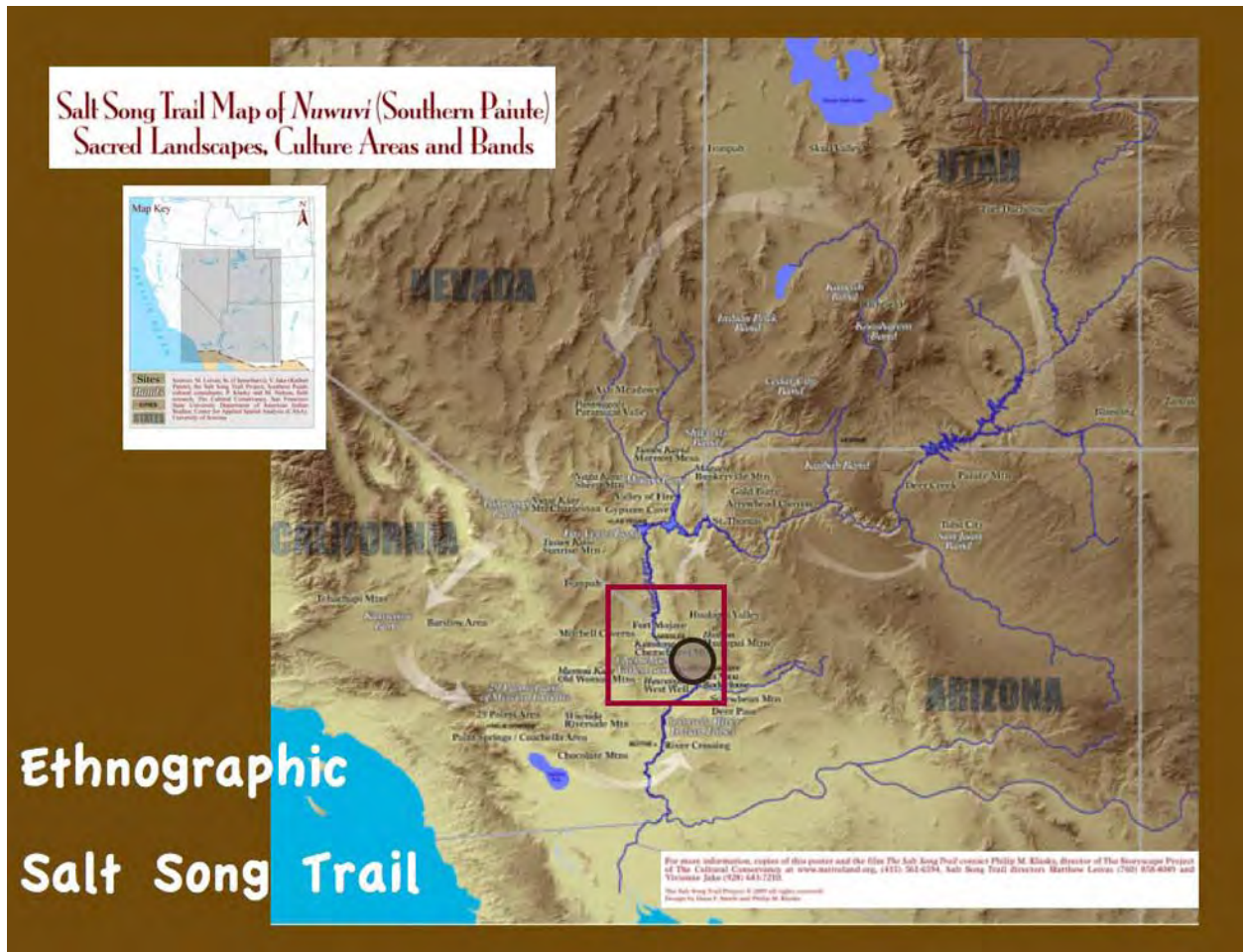
Figure 2. An adaptation of the Salt Song Trail Map designed by Dana F. Smith and Philip M. Klasky (copyrighted by the Salt Song Trail Project in 2009, the portion illustrated by permission but the complete version may be obtained through The Cultural Conservancy at www.nativeland.org ). The white arrows in the Storyscape Map illustrate a loosely defined circuit around the lower Colorado River region, beginning and terminating near the confluence of the Bill Williams and Colorado rivers at the south edge of the black circle defining the vicinity of the project study area, Standard Basin. The existence of the trail through the region within the red square is examined.

on known trails. In a few ancient stories, the places and the place names are actually first established in the distant time, by various beings....One of the versions of the Salt Song recorded by Kelly (1933[1932-1934]:18:106f) tells of the grand journey of two birds on the eastern side of the Colorado River from roughly the Blythe area to the salt caves beyond the great bend of the river to the north and then back south through the Las Vegas Valley and Ash Meadows, ultimately returning to their point of origin. They then follow the Bill Williams River, ultimately ending their journey...[Fowler 2009:88].