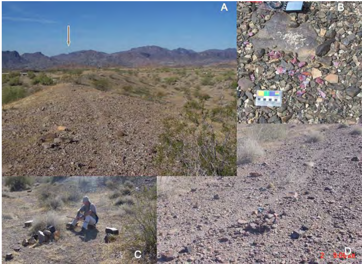
Figure 6. (a) Standard Basin trail segment bearing northwest from the Colorado River's confluence with the Bill Williams, with the Whipple Mountains and Monument Peak (arrow) in background; stacked rock feature ("prayer stack"?) on left of trail. (b) One of the numerous segregated reduction localities that include anvil stones, near trail segments in Standard Basin. (c) Collapsed stacked rock feature, possibly a shrine or "prayer stack," surrounded by site furniture (five "sitting rocks," upon one of which Steve Miller sits) adjacent to a trail on a low natural terrace above and adjacent to Dutch Flat Road. (d) Closer view of a trail and stacked rock feature ("prayer stack"?) in Standard Basin.

Previous to our study of Standard Basin, the over 6,000 acres in the project area had been dismissed by many as a wasteland: dry, sandy, and lumpy, with low sensitivity for cultural resources, thus with great potential for OHV open area use. But even though our results are provisional and preliminary, with less than half the basin being inventoried, we found over 200 locations of prehistoric cultural activity (Musser-Lopez et al. 2008).