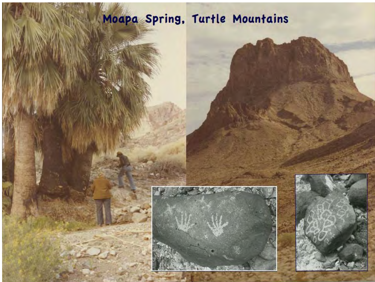
Figure 4. Moapa Spring with palms reportedly planted by Chemehuevi who traveled on foot by way of the Turtle Mountains. The salt mine described in the Salt Song is located down the mountain from the pass above the spring. Petroglyphs and stacked rock features, said to be “prayer stacks” or “trail shrines,” border the trail. Landscape-level features in the Salt Song, such as the volcanic peak near the spring (right), provide a pictorial map of ancient desert sojourns. Mac and Maggie McShan (r-l, left photo) revisited the site with BLM archaeologist Ruth Musser ca. 1981.

intermittently dispersed along area trails such as this one are small scatters of reflective white quartz crystal flakes reported to be for night travel to avoid heat (Fowler 2009; Kroeber 1925, 1951; Charles Lamb and Donald Smith, personal communication ca. 1981; Sample 1950).