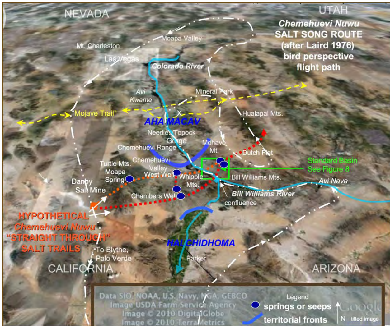
Figure 3. The northern dark blue line roughly delimits the southern half of the Mojave cultural “hearth” or heartland. The southern dark blue line shows the northern limit of the Halchidhoma core area. Variations on hypothetical “straight-through” Salt Trails from the ancestral Chemehuevi salt mine at Danby Lake along trails connected by springs between the two concentrated areas of occupation, the transition zone or “No-Man’s-Land,” are shown in red and orange dotted lines connecting the blue dots (springs). The dashed yellow line represents a riskier route for the Chemehuevi directly through the Aha Macav heartland, the “Mojave Trail,” adapted for use as the “(Old) Government Road,” with an X for the location of the 1858 wagon train raid, prompting the construction of Fort Mojave on the east side of the river near “Beale’s Crossing.” The flight patterns of the birds, sung about in the Salt Song, represented by the white arrowed dashed lines, is examined to determine its relevance to the Standard Basin project area (green box). Relying on the general route defined by the Storyscape Project map and details described by George Laird (Laird 1976) and others, we searched for archaeological and other evidence of a potential physical referent for the “Salt Song Trail.”