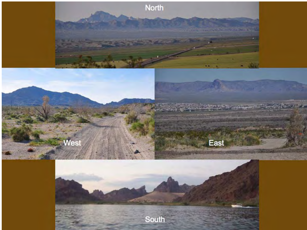
Figure 5. Landscape perspective of the Mojave Valley, with its formidable natural landscape features. Foreign travel through the Mojave heartland historically was considered risky for sociopolitical reasons. (a) Avi-kwame or “Spirit Mountain” to the north. (b) Manchester Peak and the west-bearing “Old Government Road.” (c) Fort Mojave mesa, boundary point at Oatman to the east and eastbound “Old Government Road.” (d) Topock Gorge with its needle-like volcanic formations presents a perilous up-river challenge both on foot and by vessel; the dunes are traditionally revered and protected, being associated with the spirits of the Aha Macav departed.

Mojave heartland from the south difficult to negotiate on foot. The dunes within the gorge were and continue to be a protected, revered location associated with the spirits of the Aha Macav deceased. The Chemehuevi (also called the Mohave) Mountain Range rises up on both sides of the gorge forming an east-west barrier across the south end of the valley. On the east side of the range is the sacred Mohave Mountain, the ancestral Aha Macav sanctuary to which they escaped during the Great Flood (Kroeber 1951), towering above the Mojave Valley to the northwest, Chemehuevi Valley to the southwest, Standard Basin and the confluence to the south, and Dutch Flat to the east.