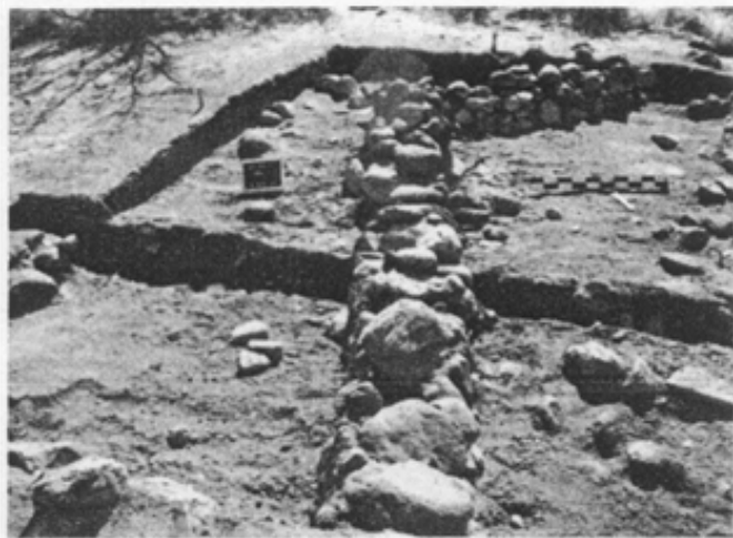
Later view after the fallen rocks were removed to reveal the base of the compound wall.

home when we found that the wall turned in the exact opposite direction of what we had anticipated. It now appears that there may have been a special alcove at the southwestern corner of the compound. We were not able to expose the entire corner during this phase of the project, so the exact nature of this area is not yet known.