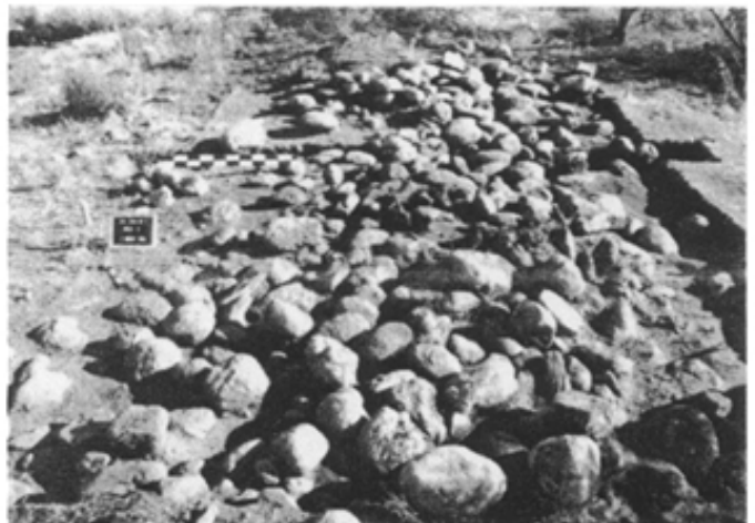
Early view showing the mass of fallen rocks that was exposed along the compound wall at the Romero Ruin.