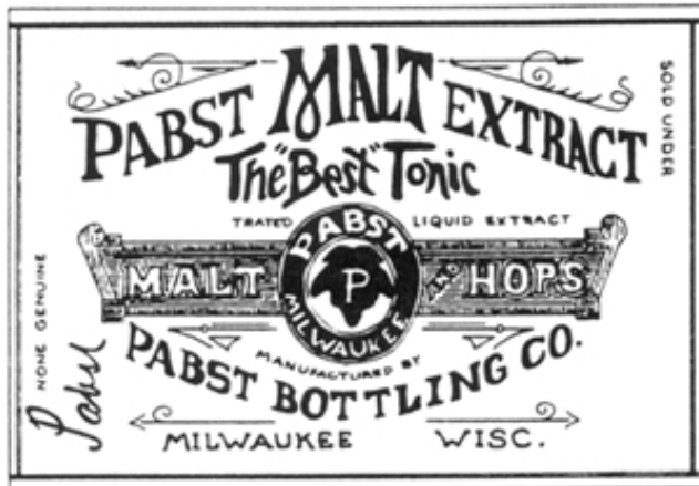
Composite drawing from 12 paper labels found on bottles dating to ca. 1890. Recovered from AZ BB:13:9 (ASM) in City of Tucson Block 180 by Statistical Research, Inc.